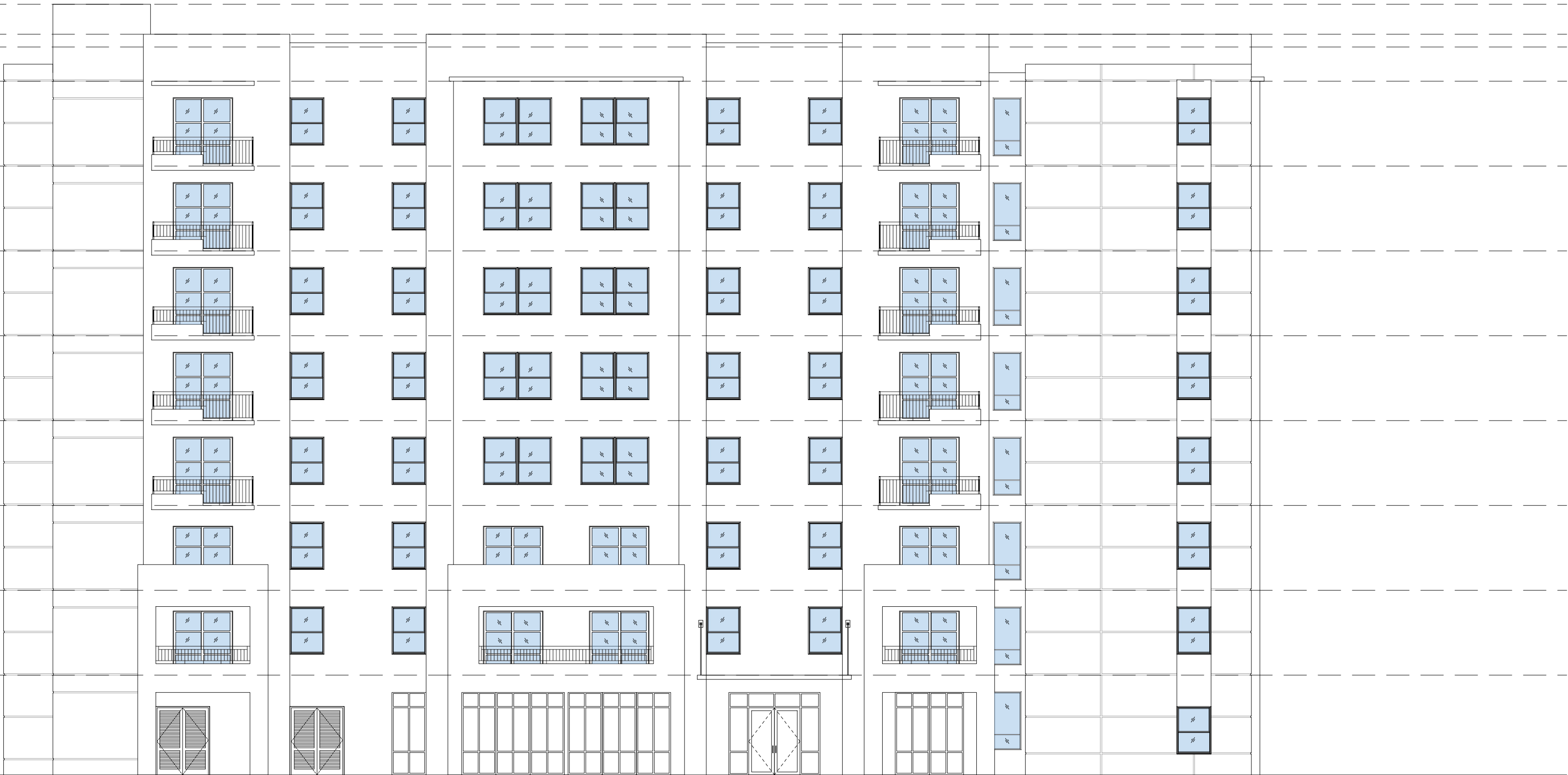
C1 BUILDING ELEVATION 3/32" = 1'-0"

+ 90'-1" STAIR ROOF + 86'-7" ROOF PARAPET + 81'-1" ROOF + 71'-2" EIGHTH FLOOR + 61'-3" SEVENTH FLOOR + 51'-4" SIXTH FLOOR + 41'-5" FIFTH FLOOR + 31'-6" FOURTH FLOOR + 21'-7" THIRD FLOOR + 11'-8" SECOND FLOOR +/- 0'-0" FIRST FLOOR