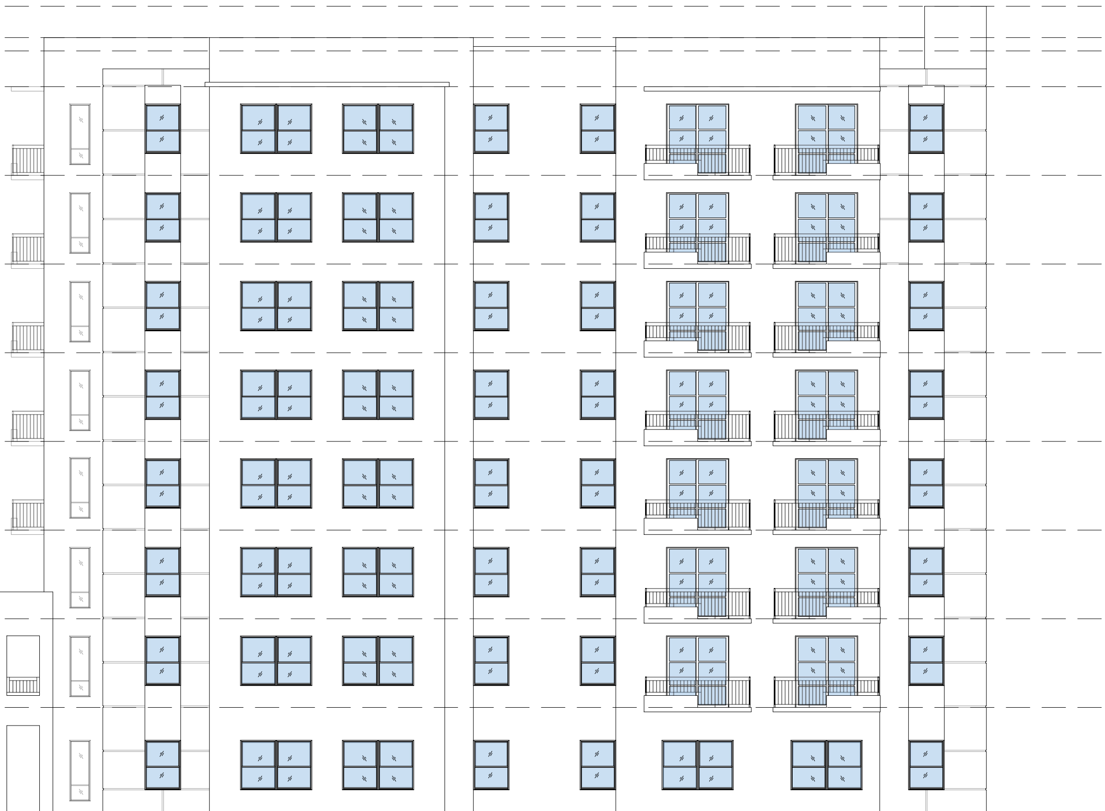
A1 BUILDING ELEVATION 3/32" = 1'-0"

+ 90'-1" STAIR ROOF + 86'-7" ROOF PARAPET + 81'-1" ROOF + 71'-2" EIGHTH FLOOR + 61'-3" SEVENTH FLOOR + 51'-4" SIXTH FLOOR + 41'-5" FIFTH FLOOR + 31'-6" FOURTH FLOOR + 21'-7" THIRD FLOOR + 11'-8" SECOND FLOOR +/- 0'-0" FIRST FLOOR